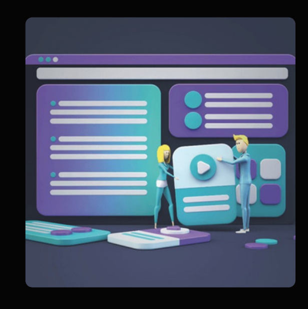
In-Depth Website Analysis

We collaborated with our client to understand their brand vision, USP and values, to create an effective SEO strategy for them.