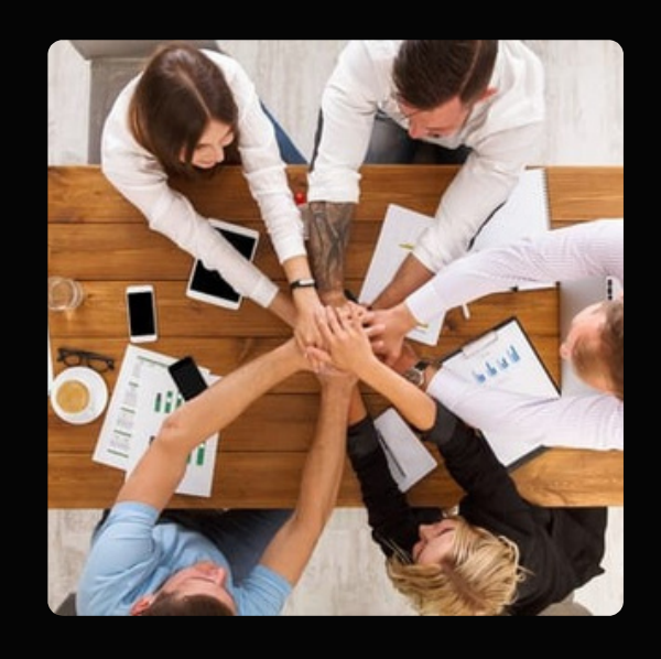
A Dedicated and Focused Team

Our client is a well established eCommerce venture that offers baby products with their 300+ offline stores. They had limited or no experience with digital marketing and had launched a new website for which they need our help to drive the overall SEO Strategy to boost the website online presence on google through SEO.